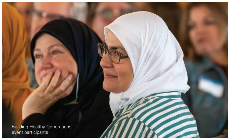
Building Healthy Generations event participants