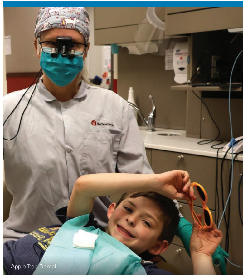
Apple Tree Dental

Read more about the Foundation's support of Apple Tree Dental.