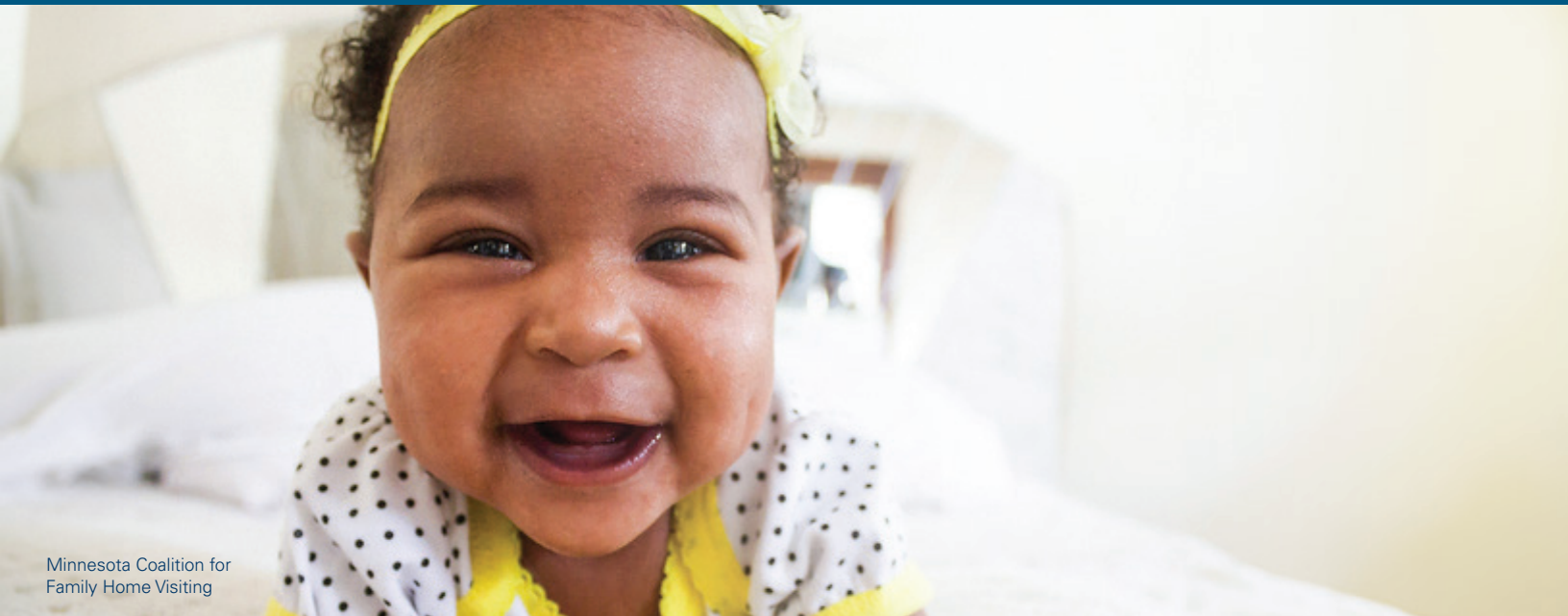
Minnesota Coalition for Family Home Visiting

Research shows large and statistically significant differences between Black families and non-Hispanic white families when it comes to pregnancy complications, death rates among birthing people and babies, anxiety, depression, and child emergency medical care.