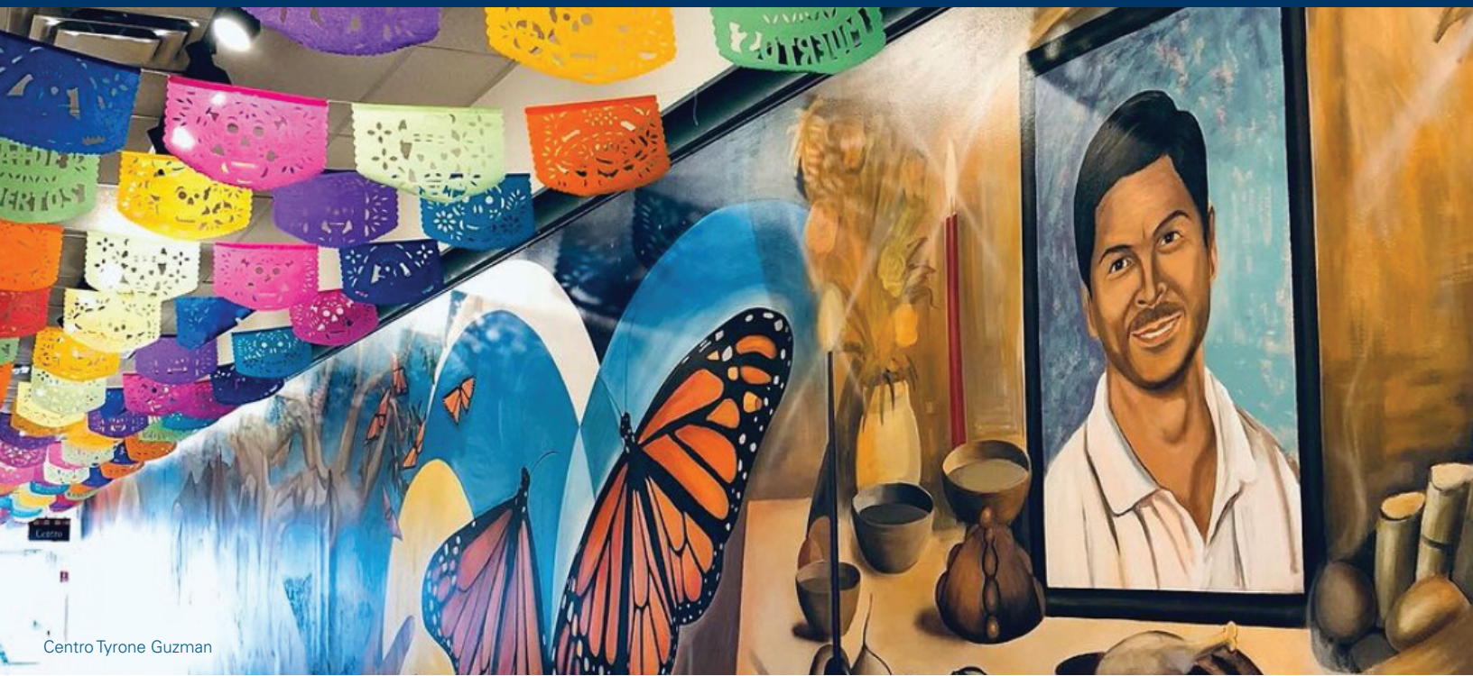
Centro Tyrone Guzman

Centro Tyrone Guzman's mission is to contribute to the wellbeing of Latine families through a holistic and intergenerational approach to education, health and wellness.