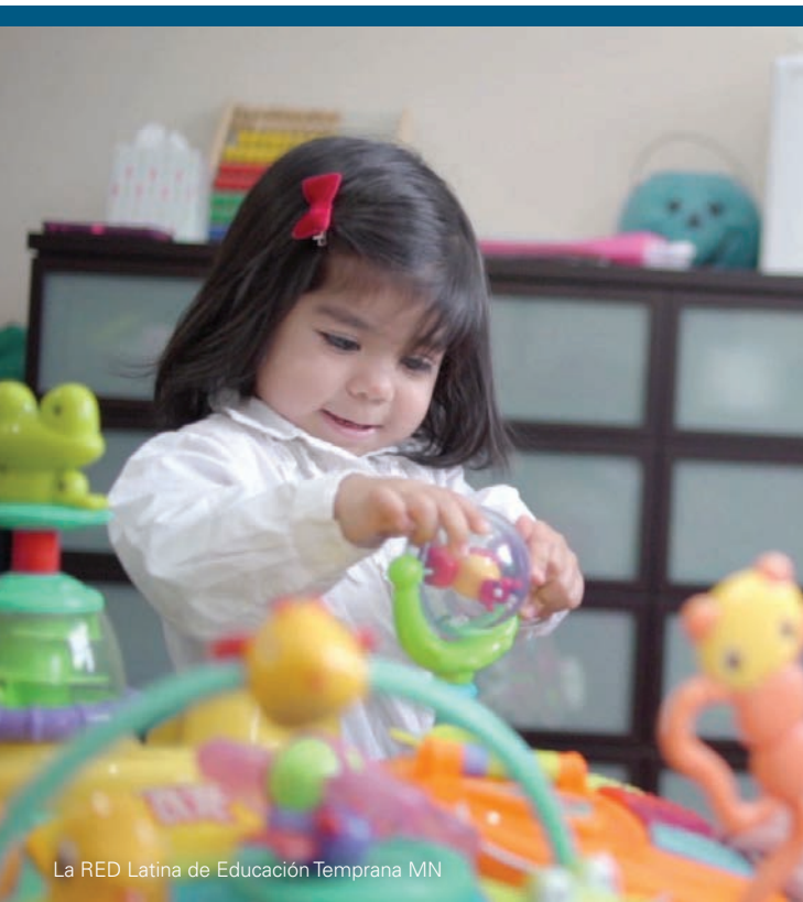
La RED Latina de Educación Temprana MN

An essential component of increasing access to quality, affordable and culturally relevant early childhood care and education is supporting child care providers.